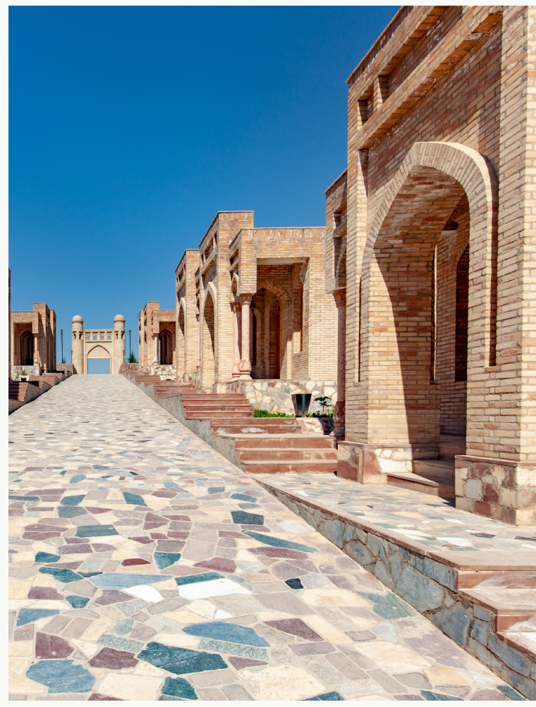
/ Small village Hisor