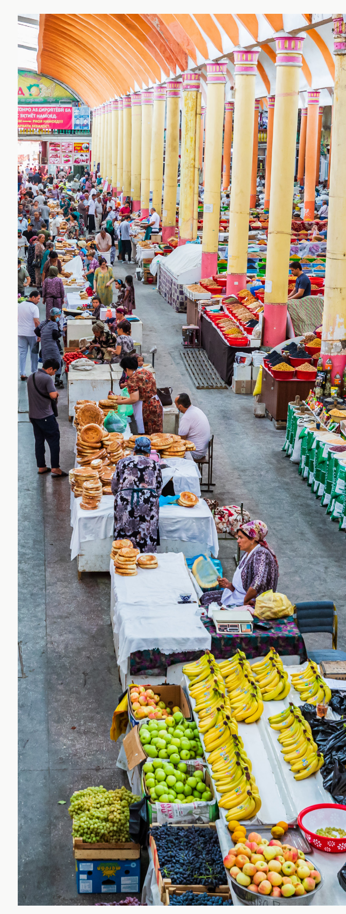
/ Panjshanbe Bazaar in Khujand