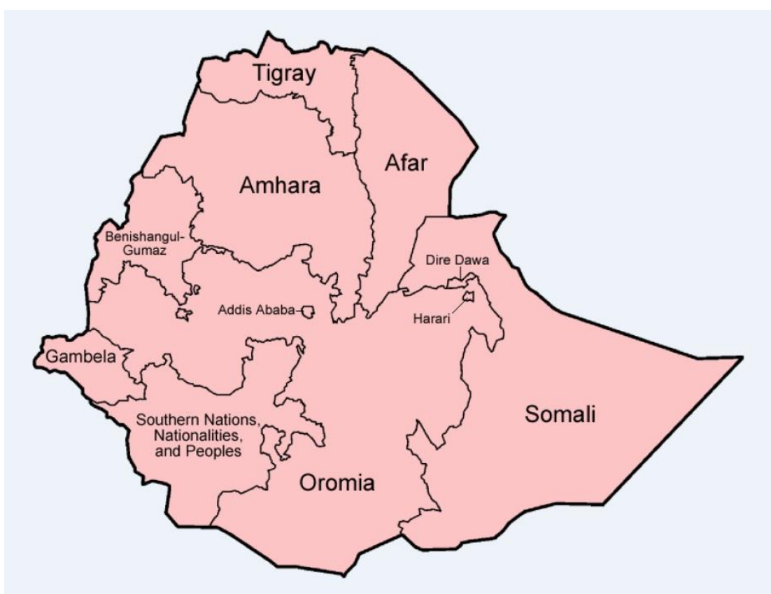
Figure 3-2 : Map of Regions

The points below were noted further to interviews held with Oromiya, SNNP and Amhara RRAs.