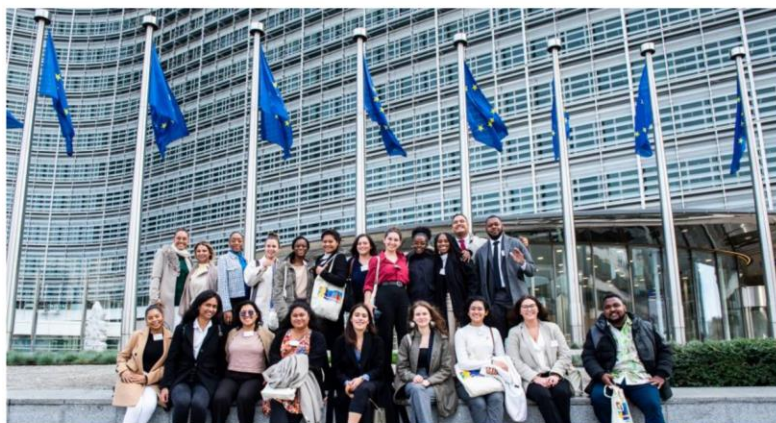
Under mandatperioden i OCT-YN, vil mandaterne deltage i månedlige webinarer og dialoger med toppolitiske EU-ledere. Privat

Article on Sermitsiaq published on December 20, 2022