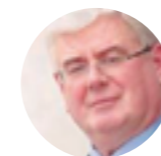
Eamon Gilmore EU Special Envoy to the Colombian Peace Process

“ Every Peace Process relies on international support, especially when it gets difficult. The EU stands with Colombia, every day as the country seeks to build peace and to end all violence ”