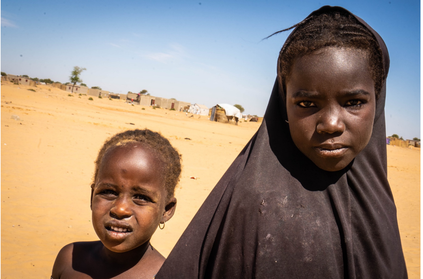
Armed attacks and insecurity in Burkina Faso's have seen more than 115,000 people uprooted from their homes.

100 million people forced to flee their homes in the past decade.