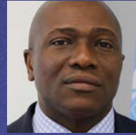
TOSI MPANU MPANU Ambassador Democratic Republic of Congo